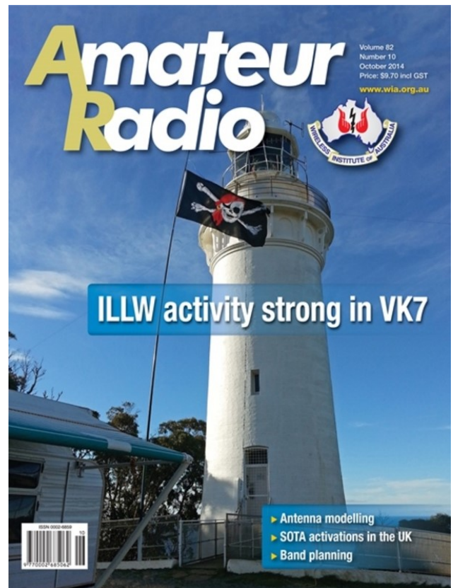
Flagpole, Pirate Day & ILLW wrapped into one